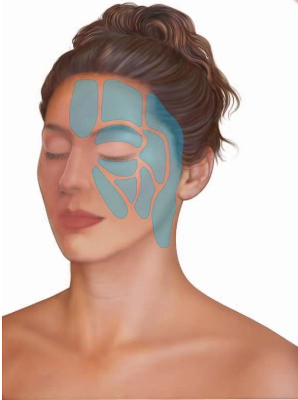
Fig. 1. An artist's rendition of the subcutaneous compartments. Reprinted with permission from Rohrich RJ, Pessa JE. The fat compartments of the face: anatomy and clinical implications for cosmetic surgery. Plast Reconstr Surg. 2007;119:2219–2227. 5

Pessa 3,5,6 and Rohrich et al. 2 This study elucidated a lattice of superficial and deep facial fat compartments discretely partitioned into multiple, independent units by fascial barriers (Figs. 1 and 2). Findings include the following: