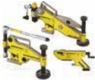
Flange Alignment Tools