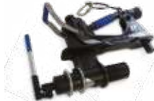
Wind Tower Alignment Tool