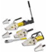
Flange Spreading Tools

When joints need to be assembled, separated or correctly aligned, nut cutters and flange spreaders offer controlled separation while alignment tools rectify twist and rotational misalignment without additional stress in pipelines.