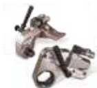
S & W Hydraulic Torque Wrenches

Enerpac offers a variety of controlled tightening options to best meet your application from electric and pneumatic torque wrenches and manual torque multipliers to a comprehensive range of hydraulic torque wrenches and interconnectable bolt tensioning tools.