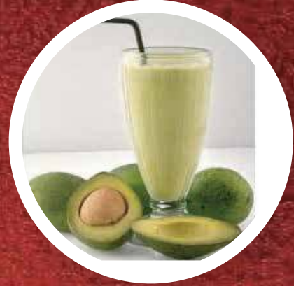
Avocado Milk Mix