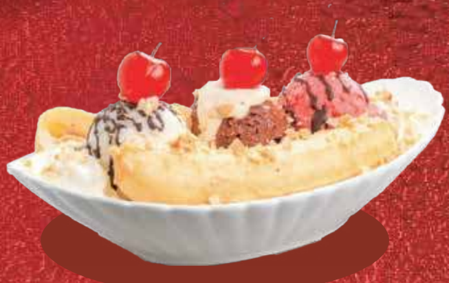
Banana Split Icecream 3,000 RWF