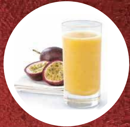
Passion fruit Juice