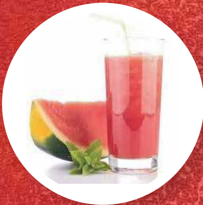
Water melon Juice