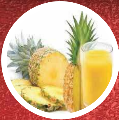
Pine Apple Juice