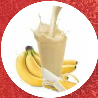
Banana Milk Mix