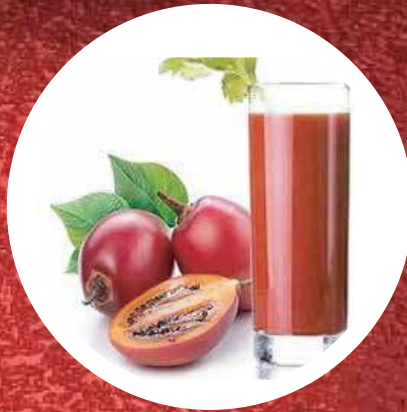
Tomato Tree Juice