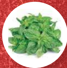
Fresh Basil Leaves