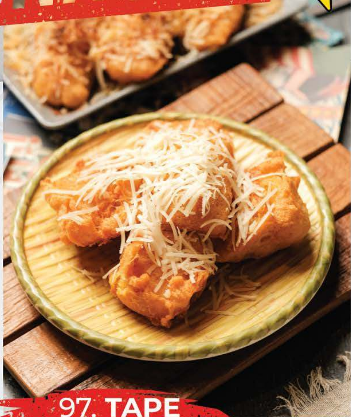
97. TAPE GORENG