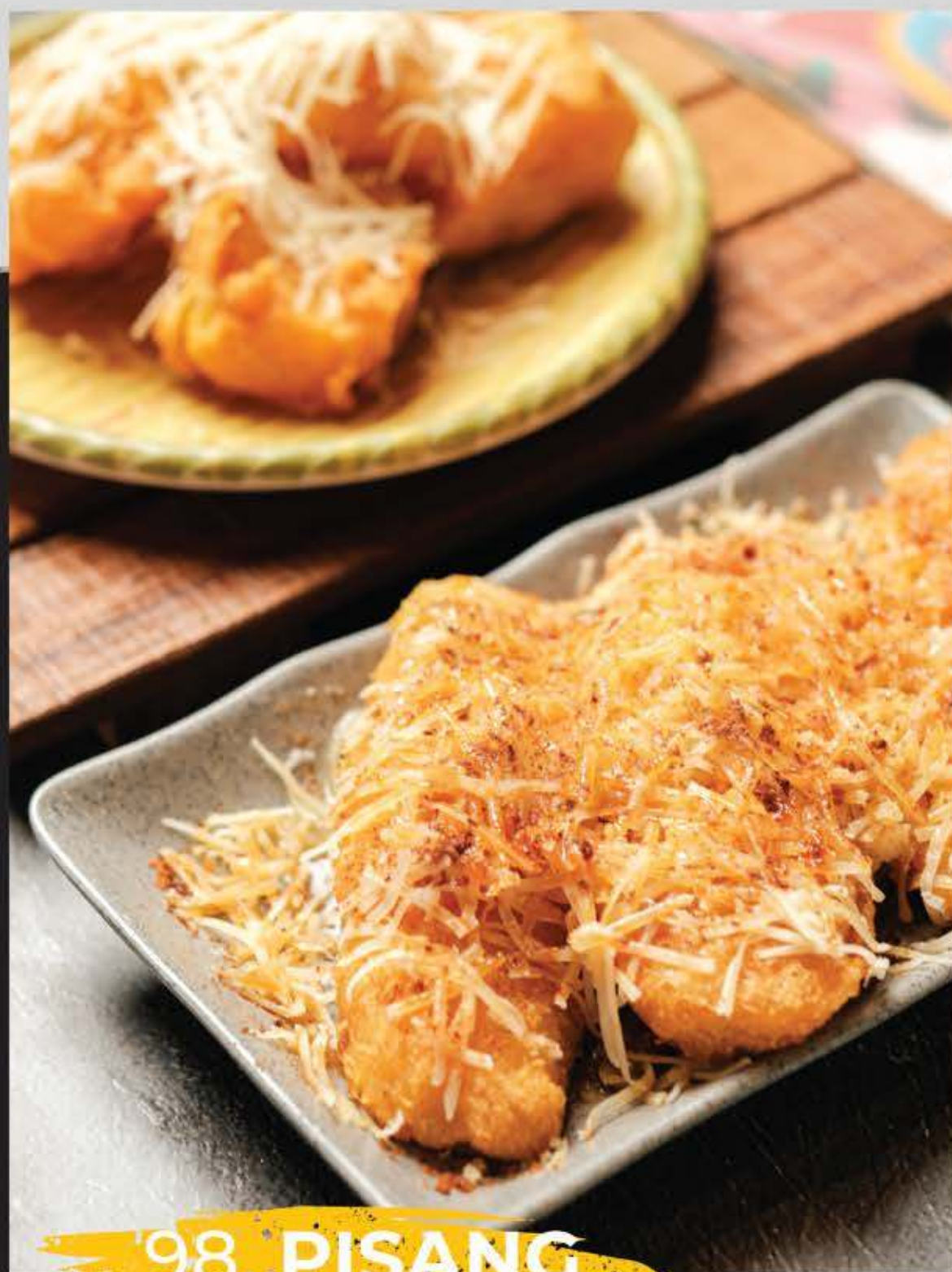
98. PISANG GORENG