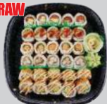
SPICY COMBO TRAY

5 pcs Spicy Crab Roll, 5 pcs Spicy Salmon Roll, 10 pcs Spicy California Roll, 10 pcs Spicy Tuna Roll