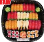
NIGIRI DELUXE TRAY

12 pcs Tuna Roll & Salmon Roll, 30 pcs Assorted Nigiri Sushi