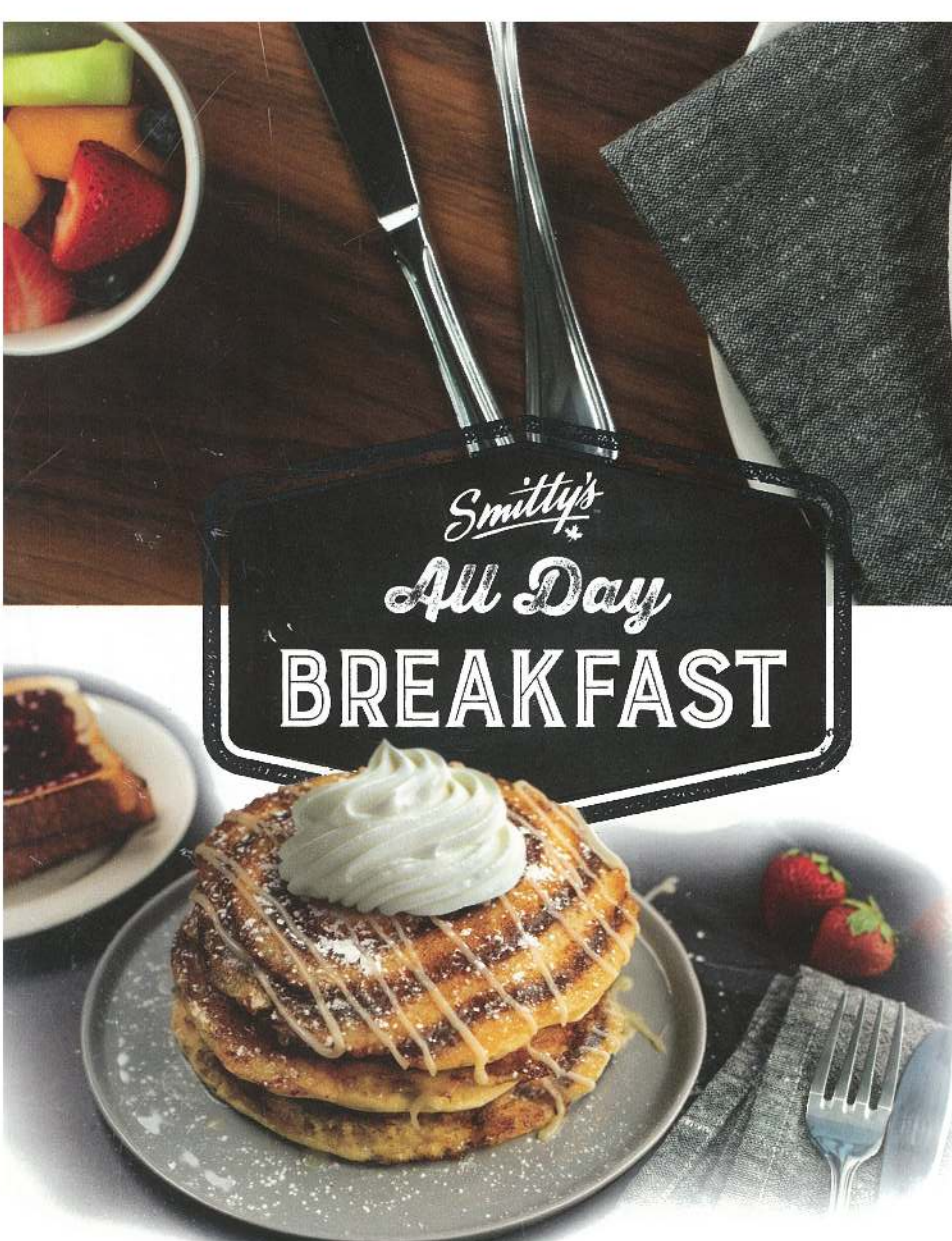
{ CINNAMON SWIRL PANCAKES }