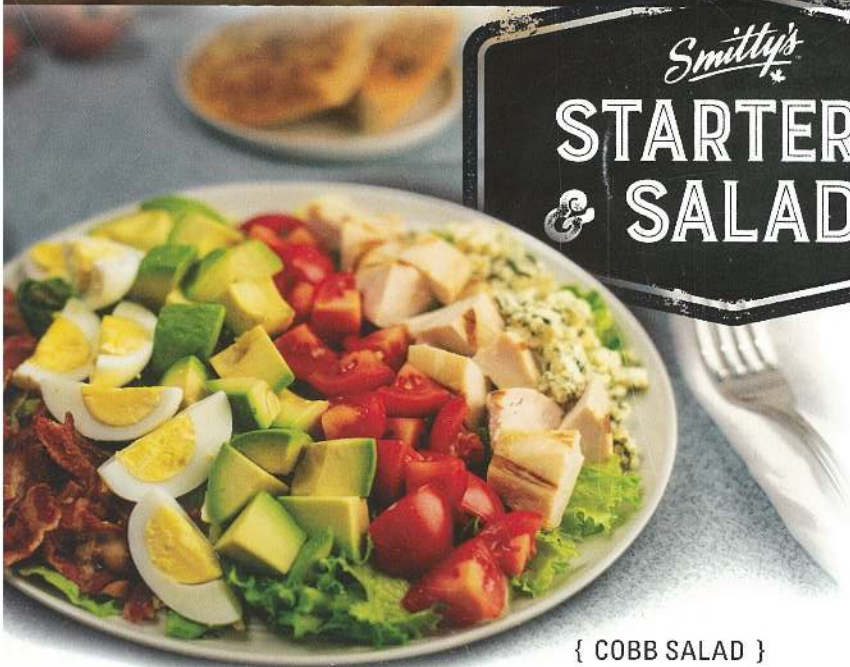
{ COBB SALAD }