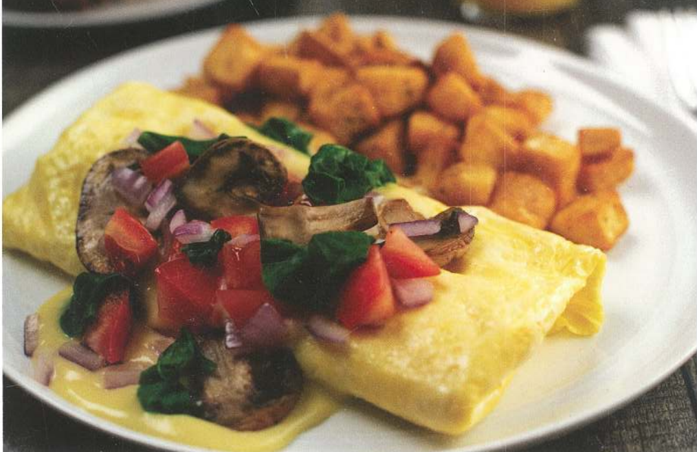
{ SPINACH & SWISS OMELETTE }