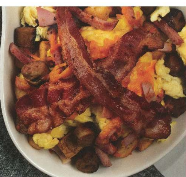
{ MEATLOVER'S SKILLET }