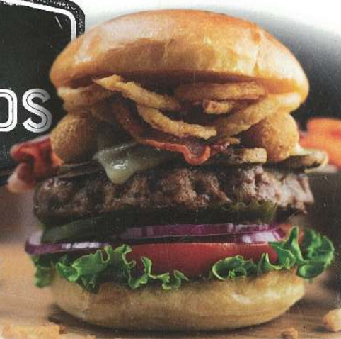
{ ULTIMATE MOZZA BURGER }

A grilled tortilla filled with shredded cheddar cheese, diced tomato, green onion, and a sliced chicken breast. Served with sour cream and salsa. 14 99