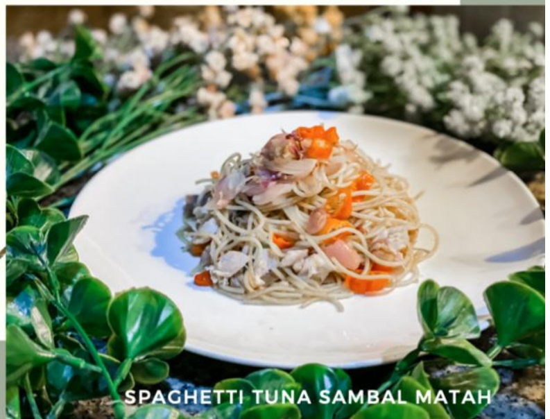
SPAGHETTI TUNA SAMBAL MATAH