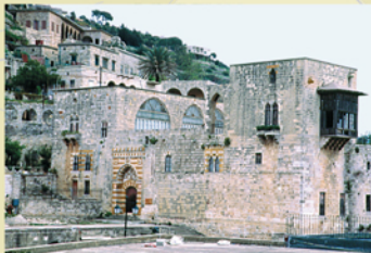
The palace of Gergis Baz

The Natural Reserve: This area covers 500 square kilometers of Cedar forests, with no less than 3 million trees, which extend from Ain Zhalta to Barouk and Maaser el Chouf.