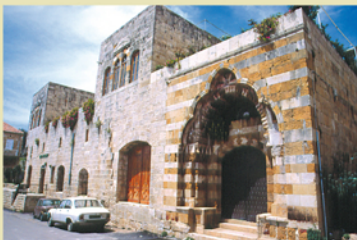
Palace of Emir Younes Maan

With the disappearance of the second dynasty of