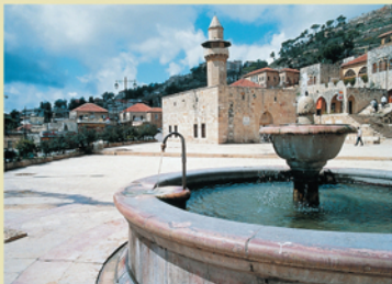
The Midan (Public Square)

The municipality of Deir el-Qamar is the oldest one in Lebanon. It is since August 1864 that Deir el Qamar is endowed with a municipality and a municipal council.