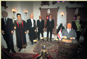
Marie Baz Wax Museum

the Jumblats and Emir Bechir II in 1825, but was rebuilt soon afterwards.